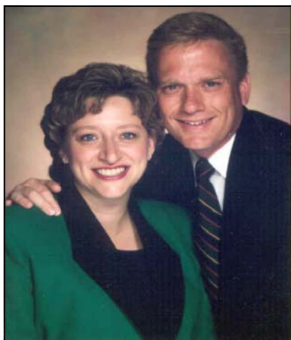
YOUR NEIGHBORHOOD REALTORS